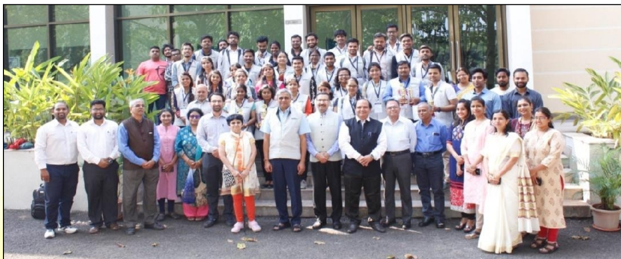
IITM-GSDP- Second Batch 2019

All queries and feedback regarding this newsletter should be addressed to: