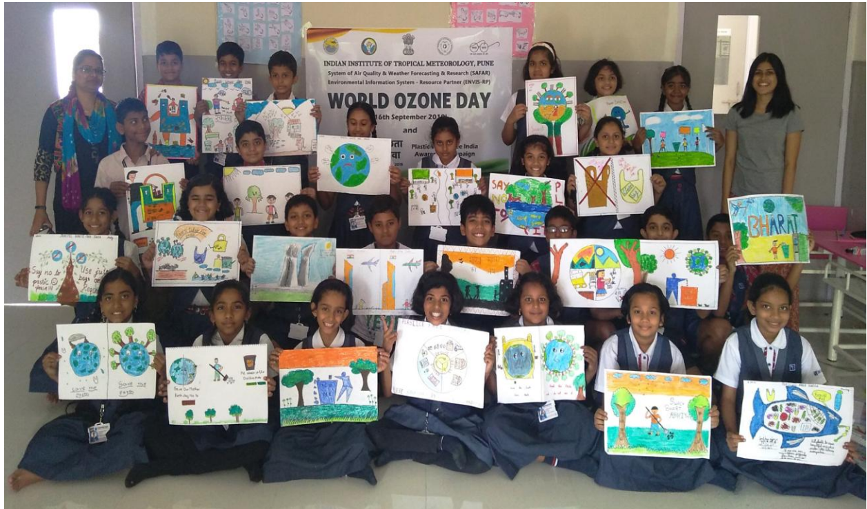
Drawing Competition at Sri Chaitanya Techno School, Pune