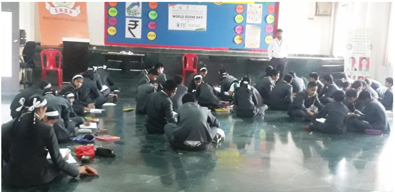
Drawing Competition at SNBP School & Jr. College, Pimpri