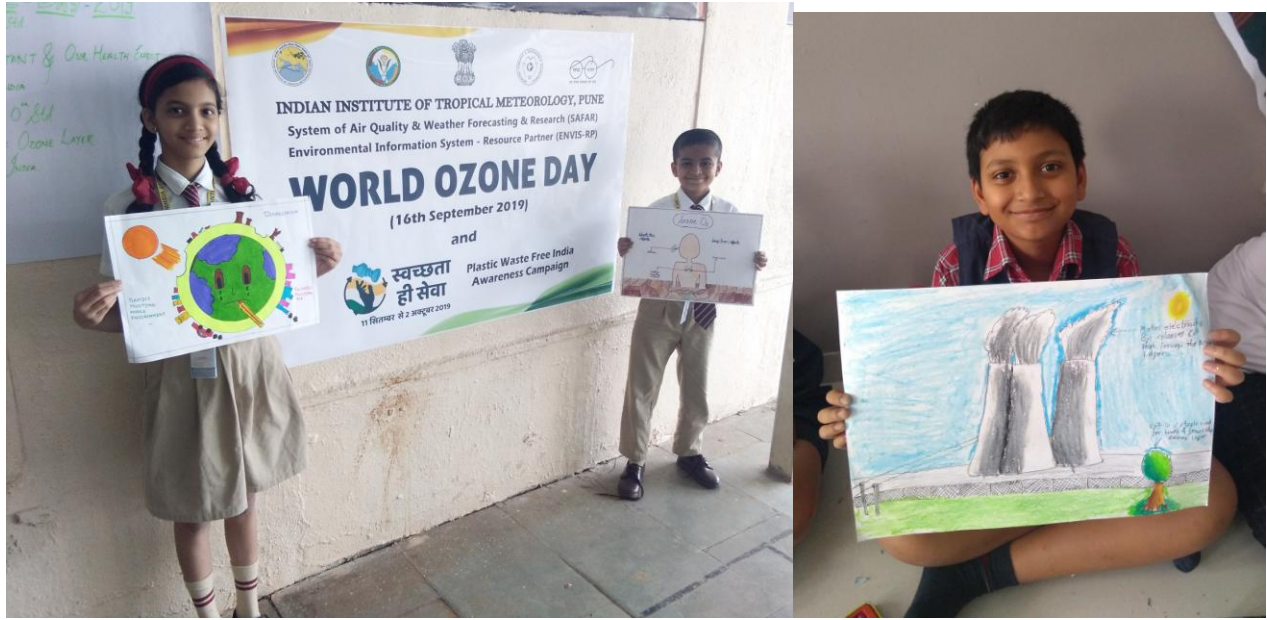
Students Participating in Drawing Competition