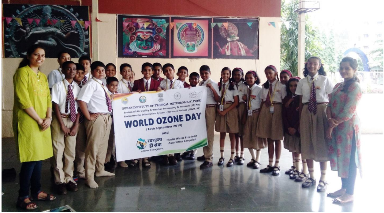
Drawing Competition at MAEER'S MIT School, Pune