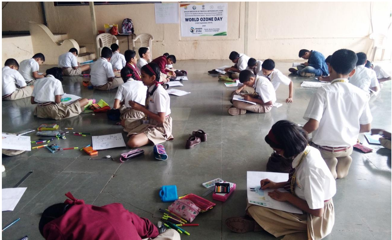
Students Participating in Drawing Competition